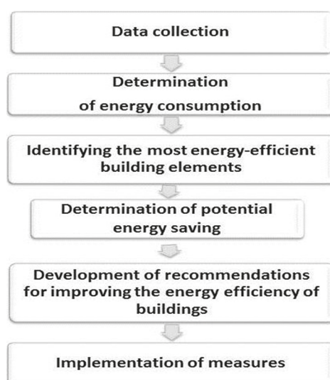
Fig. 2. Algorithm of energy audit work

To implement the objectives of the information campaign, it is appropriate to use both means of interpersonal communication, information tools aimed at a limited audience (brochures, posters, trainings, lectures (learning), individual consultations, etc.), and the media. To achieve the goal of promoting the EU's experience in energy conservation, it is planned to create a website that will also provide media support for the Project.